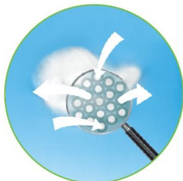
Hollow Recron® Fibrefill under a microscope